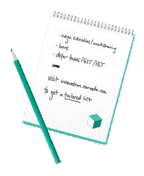
Find COVID-19 support and other programs and services here