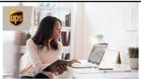
How UPS is responding to the Coronavirus

Click here to access the information on the Economic Development website